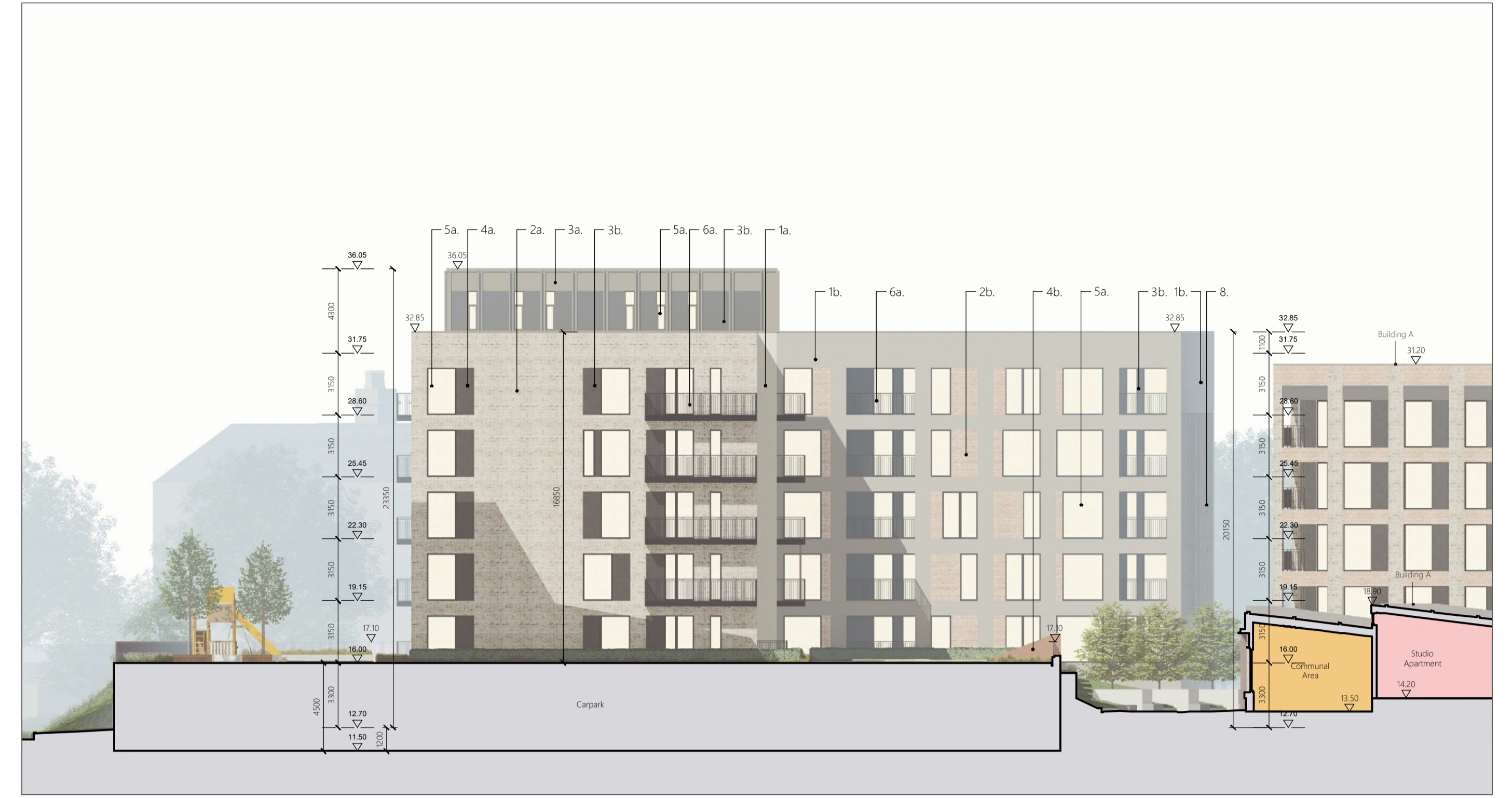
2 BUILDING D: EAST ELEVATION D2 SCALE 1:200