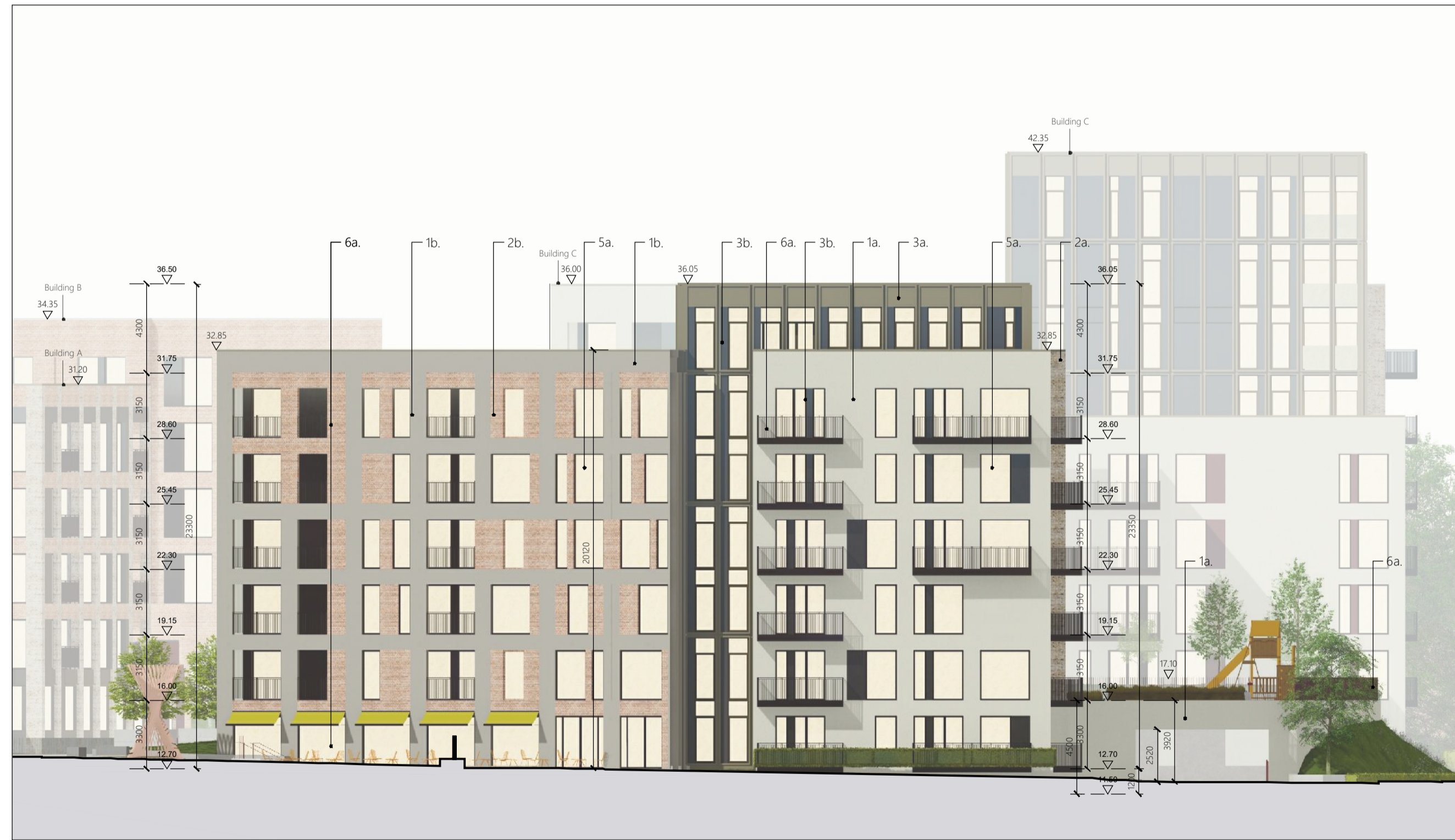
3 BUILDING D: WEST ELEVATION D3 SCALE 1:200