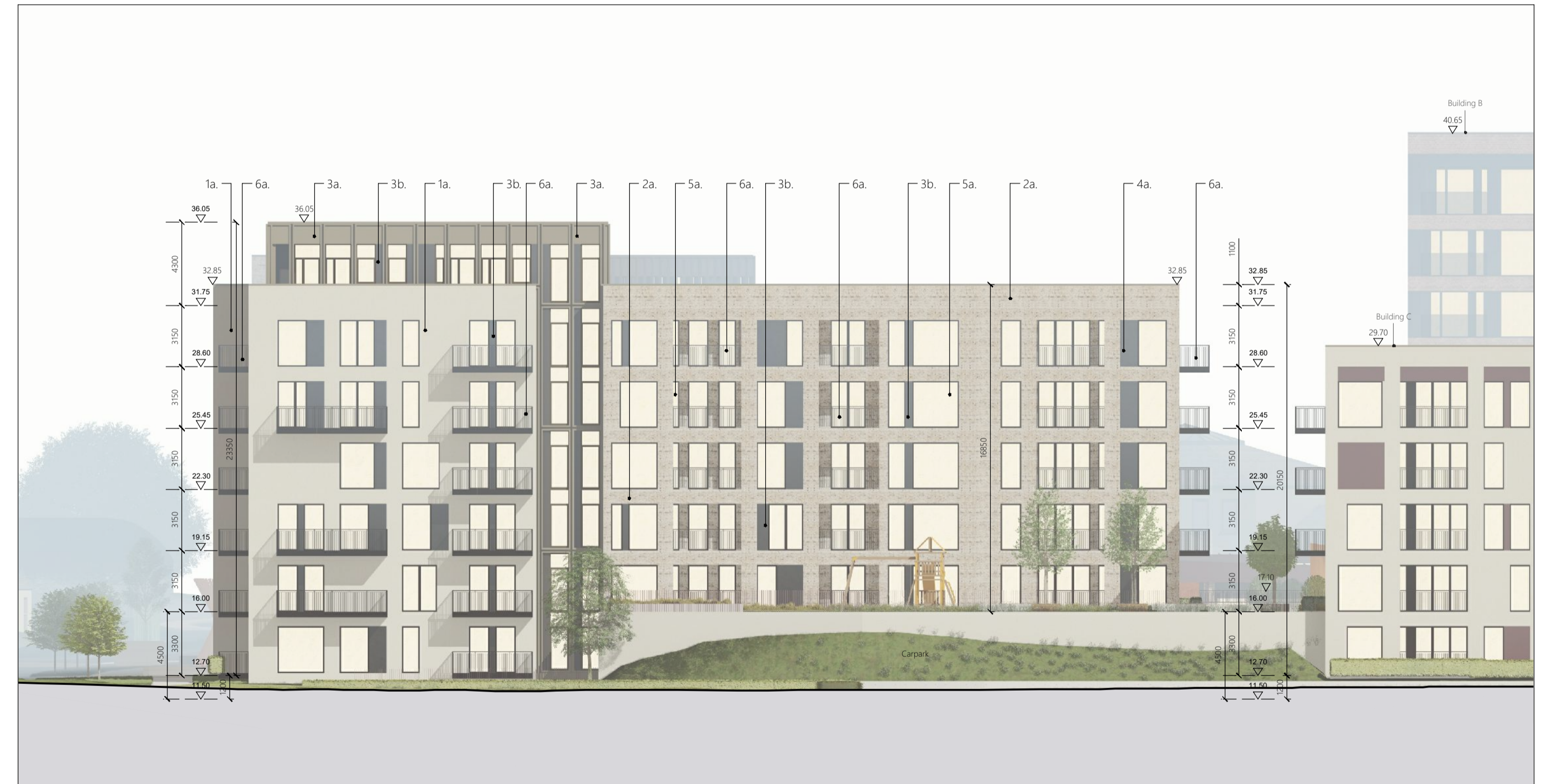
4 BUILDING D: SOUTH ELEVATION D4 SCALE 1:200