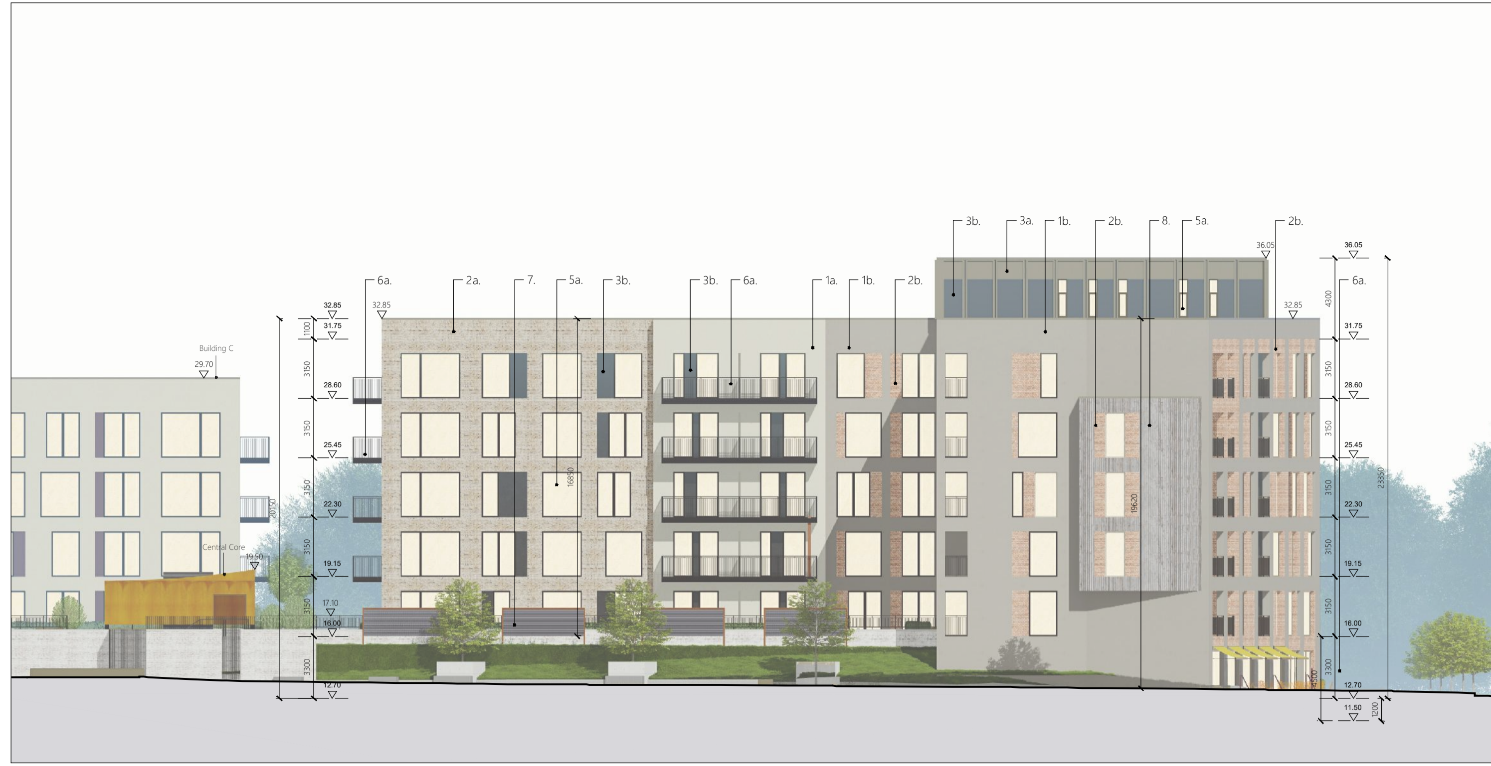
1 BUILDING D: NORTH ELEVATION D1 SCALE 1:200